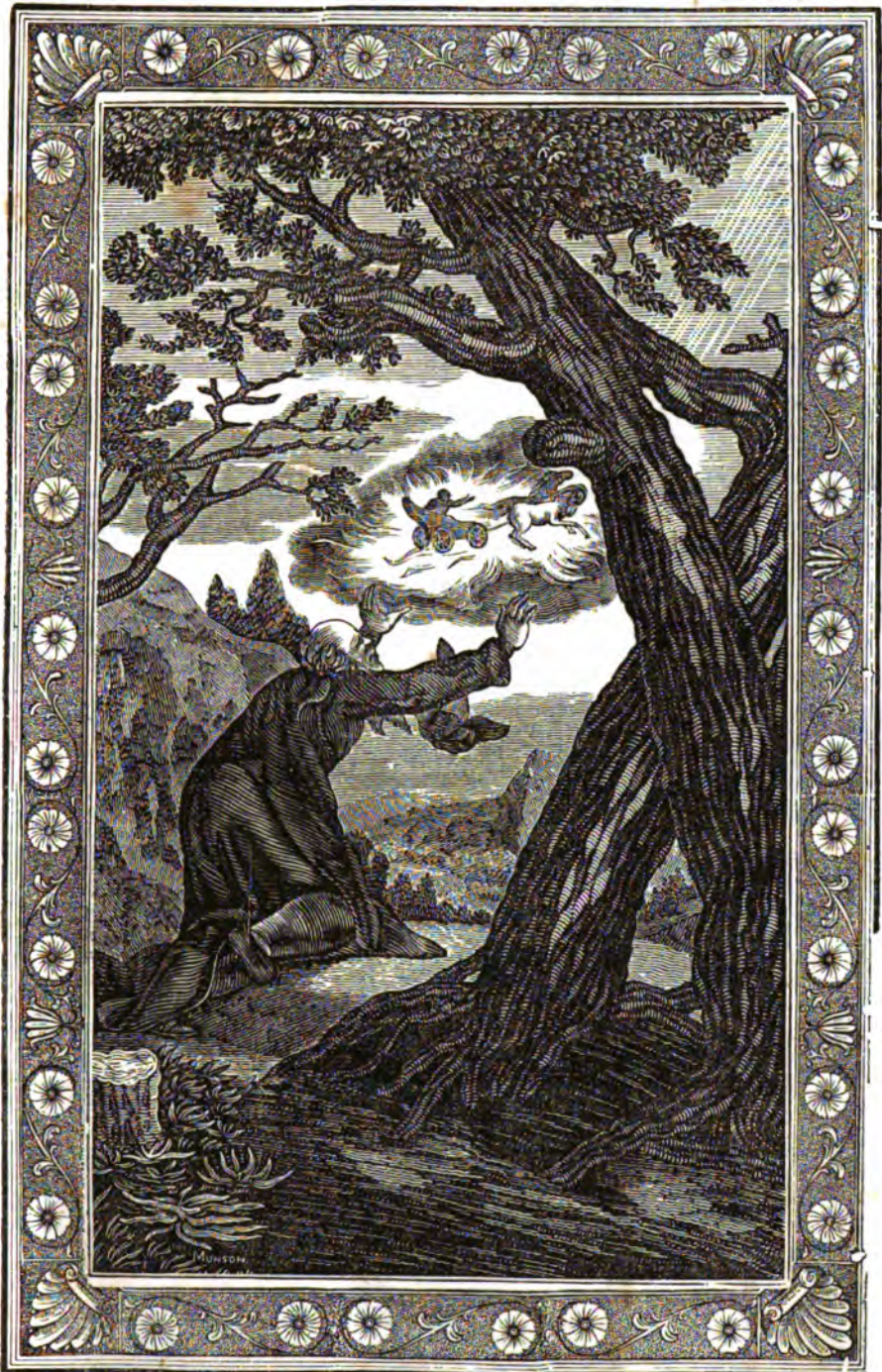
TRANSLATION OF ELIJAH.